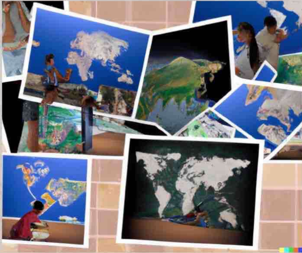
PHOTO COLLAGE EVENT