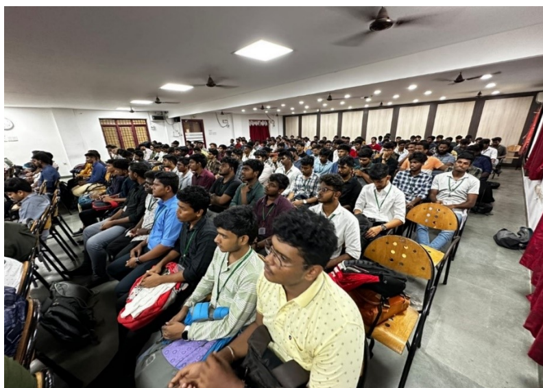
Participants listening with involvement