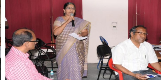
Officials Addressing The Student's Queries