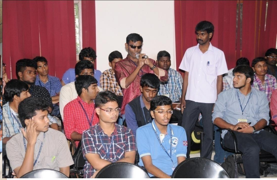
Students Raising Their Concerns During The Open Forum