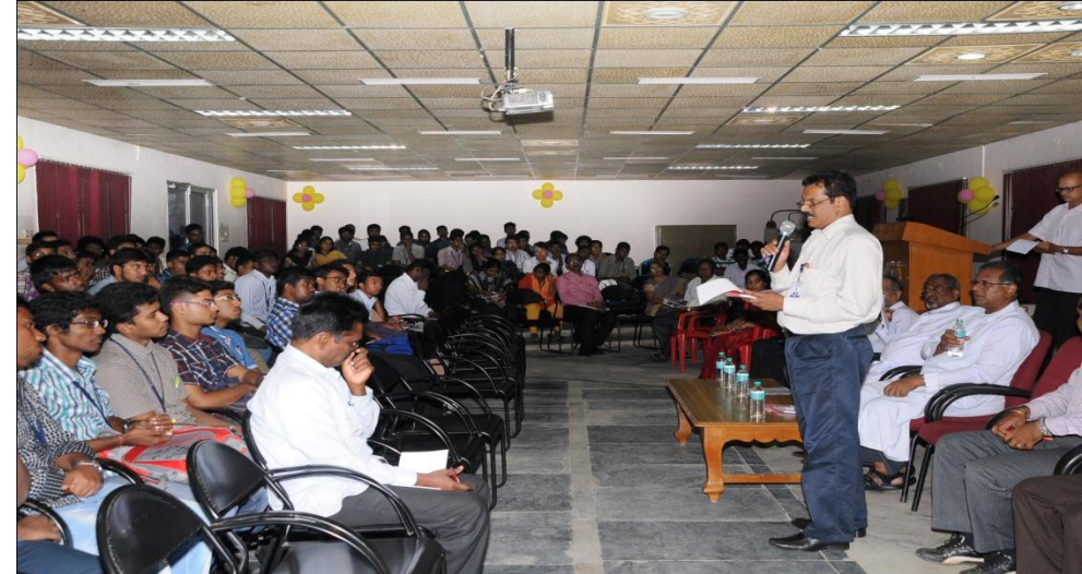
Officials Addressing The Student's Queries