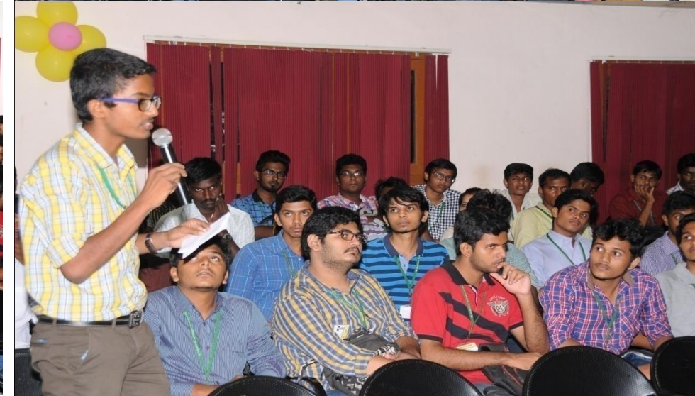
Students Raising Their Concerns During The Open Forum