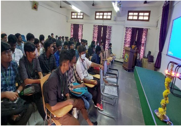
Participants of the programme