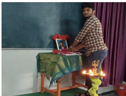
Flower tribute – Students