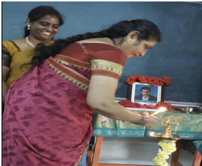
Lighting the lamp – Coordinator