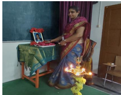
Flower tribute - Coordinator