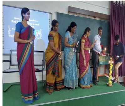
Lighting the lamp – Dignitaries