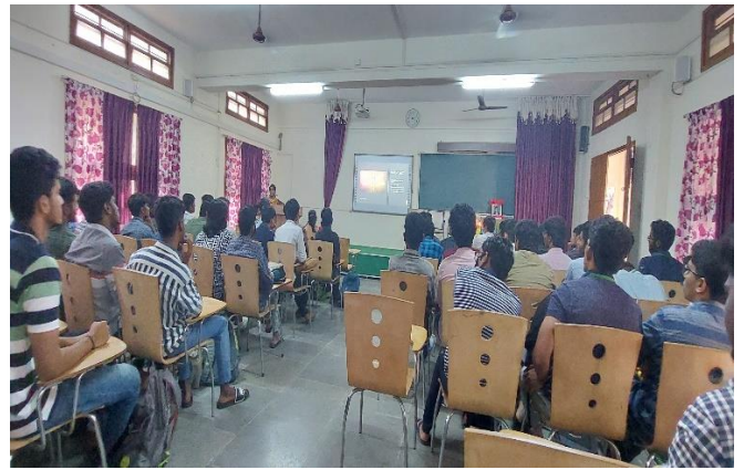
Participants of the programme