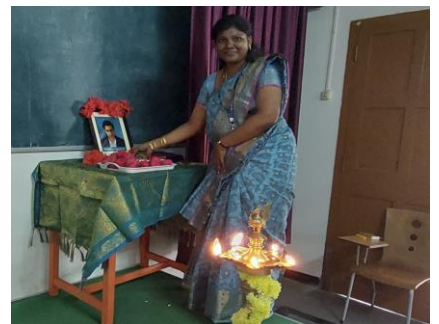
Flower tribute – Faculty members