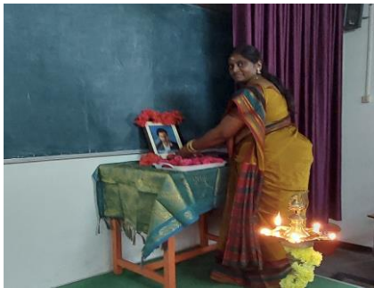
Flower tribute by the Chief guest