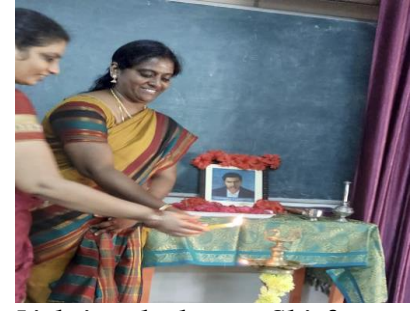
Lighting the lamp – Chief guest