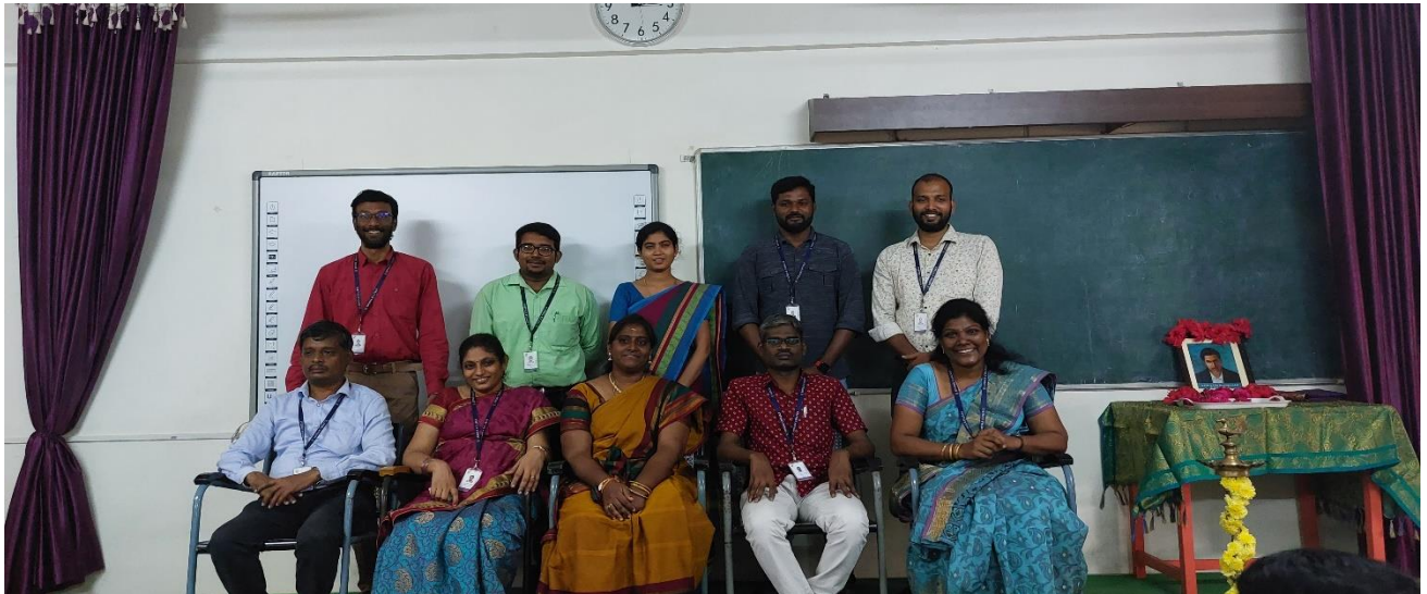
Faculty members of the Department with the chief guest