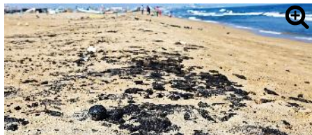
Oil spills at the sea and beach