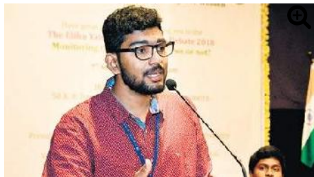
A student participant at the debate