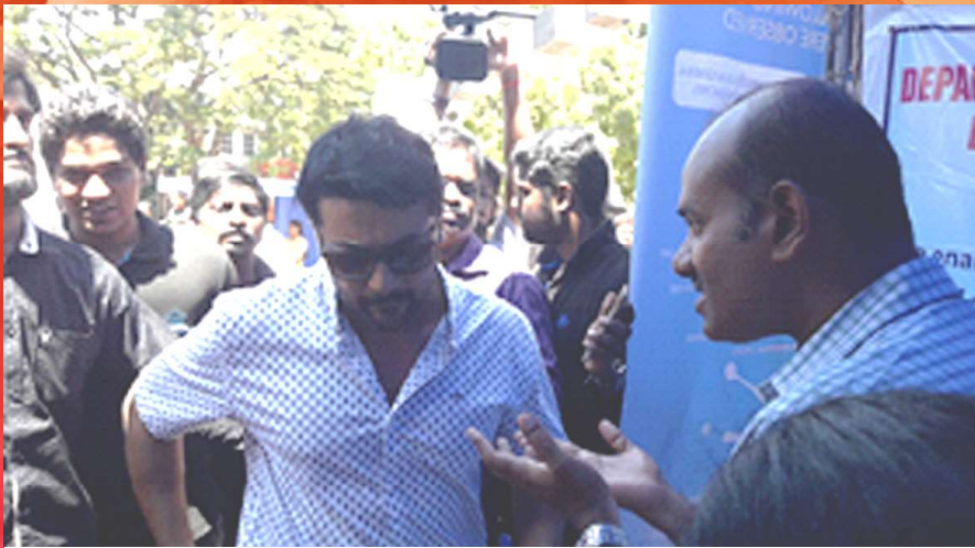
Actor Suriya Listening About Outreach

Event Venue: Seva Mela Lady Andal School, Harrington Road Chennai -31 Seva Mela, an initiative of Chennai Mission Trust and CIOSA is an opportunity for every Chennaiites to experience the wonderful work that the NGOs of the city are doing under one roof and across two days.