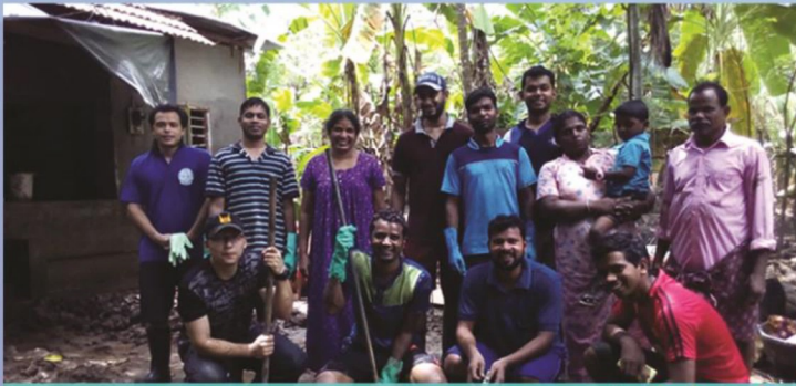
At Gothureth , cleaning the houses which were covered with muck and slush