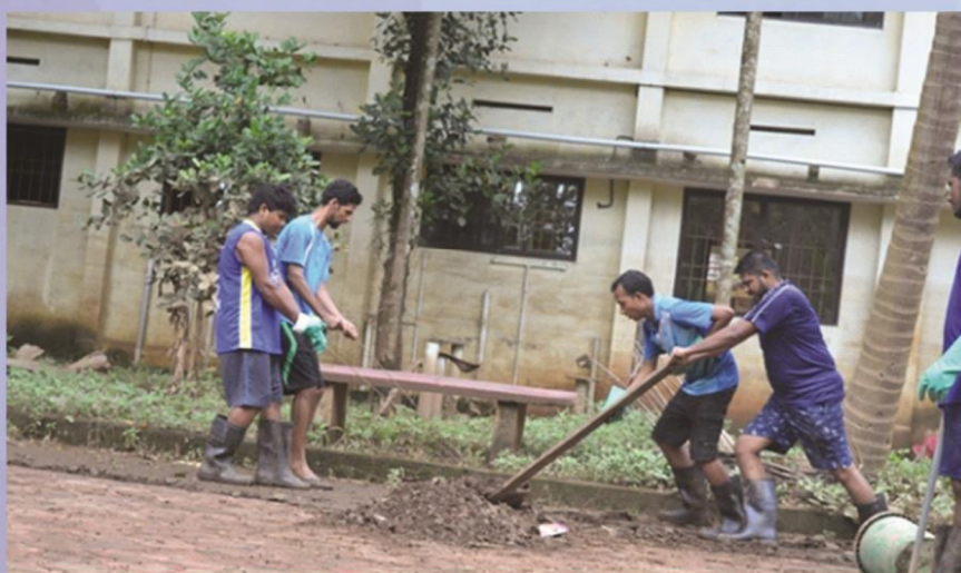
At Aluva , removing the muck

Trucks with relief materials were dispatched to Waynad and to the Tea-Estate workers in Moonar! Once the flood waters subsided, a special relief work was organized by the Department of Philosophy of Loyola College. The first year M A students, 48 in number, guided by the Kerala Jesuits in Ernakulam and Waynad, meticulously planned and sent five groups consisting ten or nine students in each to five different places in Kerala. The whole flood relief work was a seven day program (27/8/2018 to 1/09/2018).