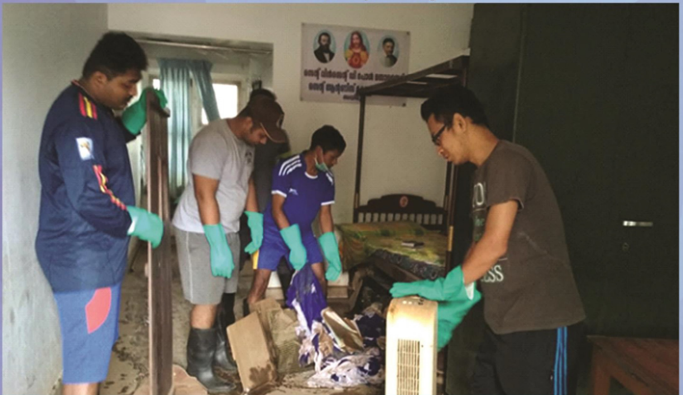
At Chettikad , Ernakulam , cleaning the houses

The students of the Department of Philosophy came from various parts of India and a few from other nationalities like Sri Lanka, East Timor, Kenya and Uganda.