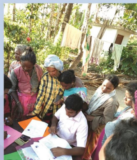
At Waynad , distributing the materials

These five groups worked in five different places in central Kerala, such as Aluva, Chettikad, Ayrur, Gothurathe where cleaning work was the focus. While in Waynad, the group was engaged in packing up the relief materials and reaching them to the needy in the interior places, quite often unreachable by many agencies.