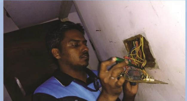
At Ayrur , Ernakulam , dispelling the darkness