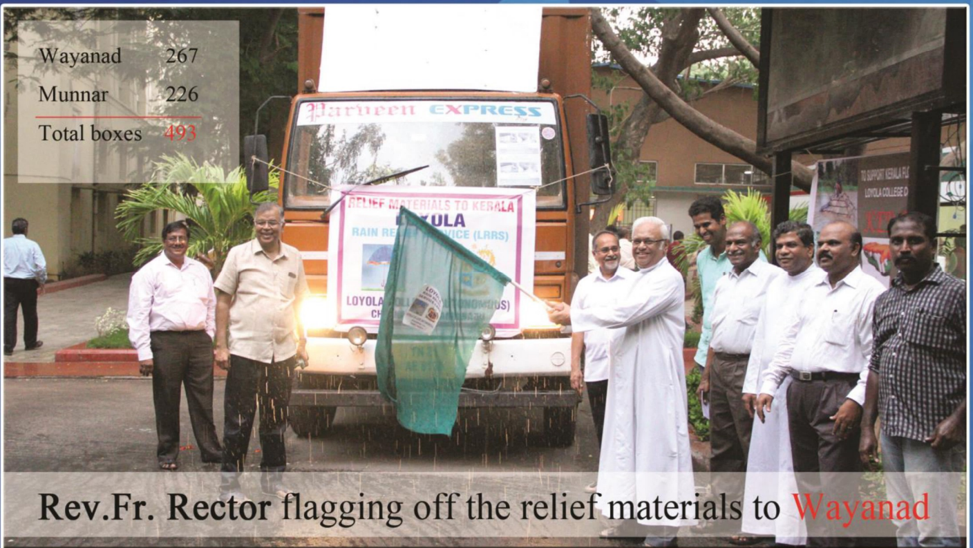
Rev.Fr. Rector flagging off the relief materials to Wayanad