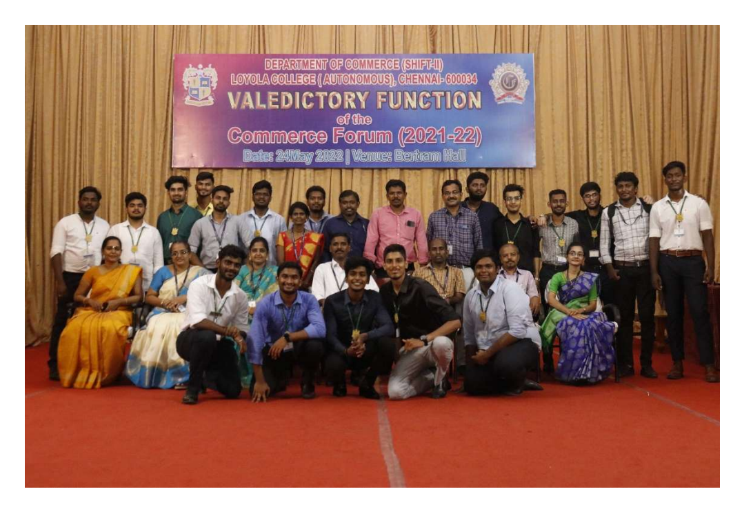
COMMERCE FORUM MEMBERS WITH DEPARTMENT FACULTIES