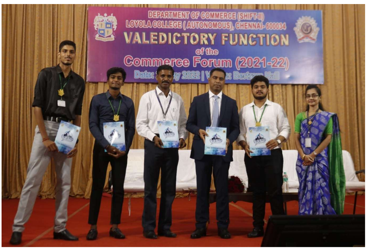
RELEASE OF NEWSLETTER CRESCENDO